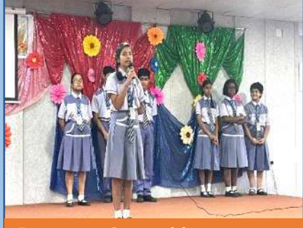
Extempore Competition To encourage students think quickly and creatively.