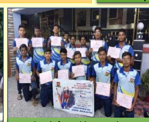
Proud of our cricket team that participated in the cricket competition organised by the council