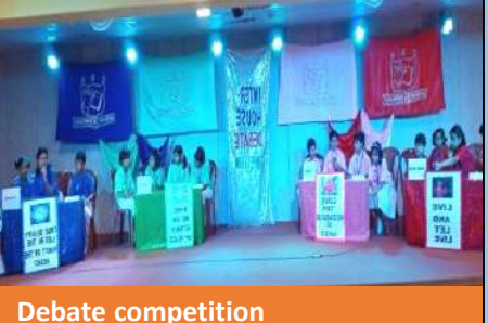
An excellent tool to encourage critical thinking skills.